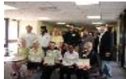
<Spring06 PDI Graduation>

HAVE YOU DECIDED NEXT STEP AFTER GETTING GRADUATE DEGREE? If NOT , the Professional Development Institute is an excellent comprehensive program sponsored by the University of Arkansas Career Development Center that will help enhance graduate student professionalism and empower graduate students to present themselves effectively as candidates for employment or for graduate and professional schools.